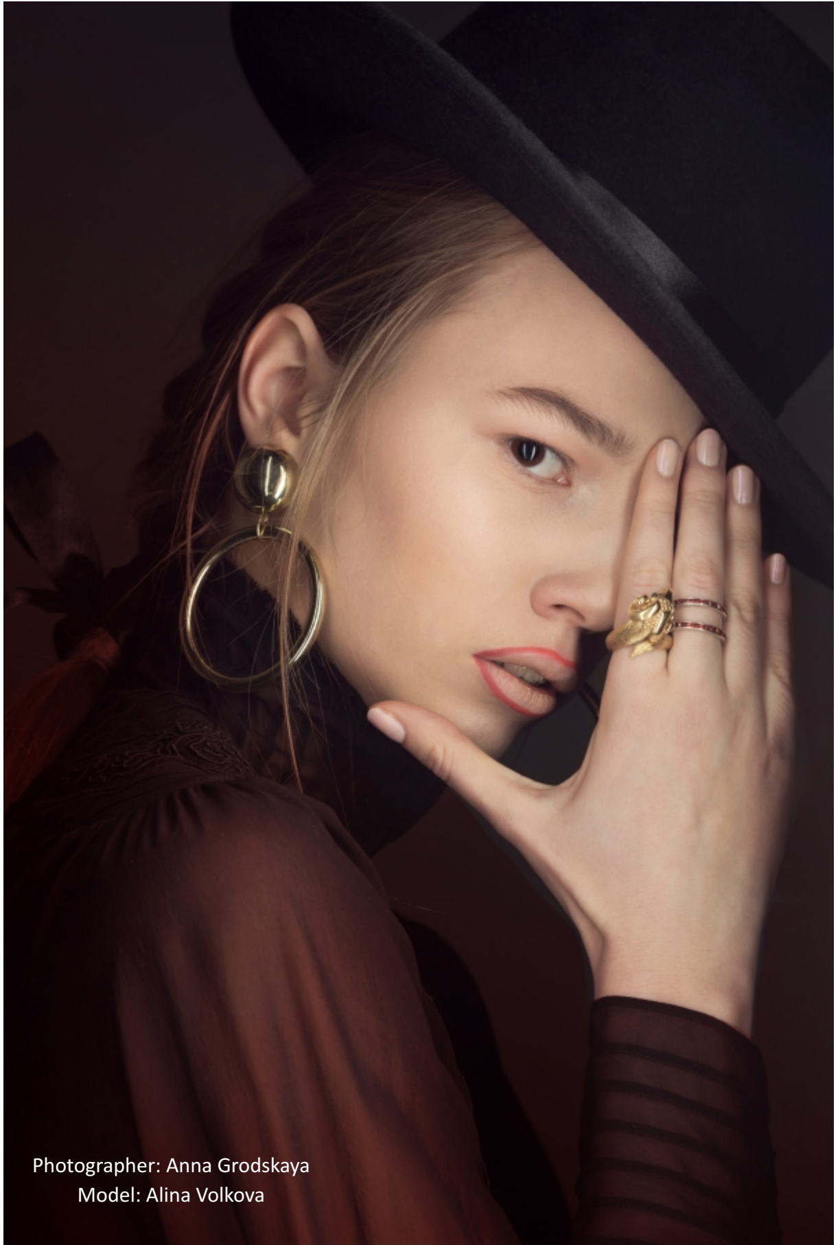
Model: Alina Volkova